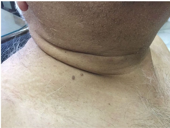
Figure 1. Patient's acanthosis nigricans and skin tags.

glucose ranges were 300 to 450 mg/dL. The patient was admitted with persistent symptoms, and random glucose measurement was 16.6 mmol/L (300 mg/dL).